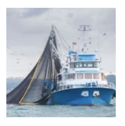
The Fish Banks Seminar Oct 29 / 10-1 PM / Online

Learn about the latest trends in wastewater management, biosolids, and residuals from students in this poster session and competition. <u>MORE INFO</u>